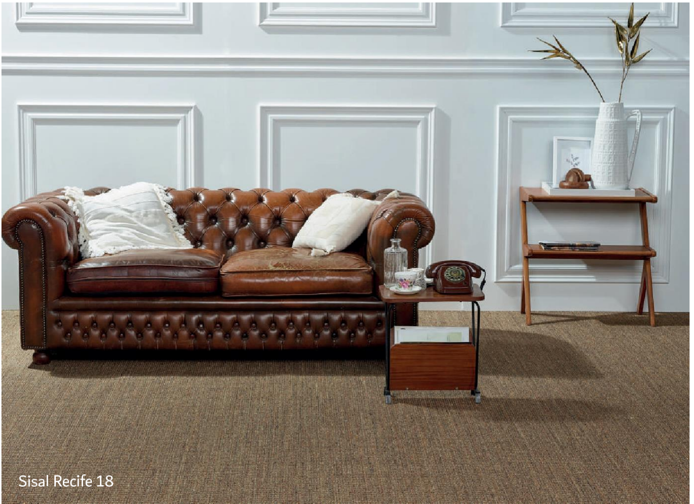
Sisal Recife 18