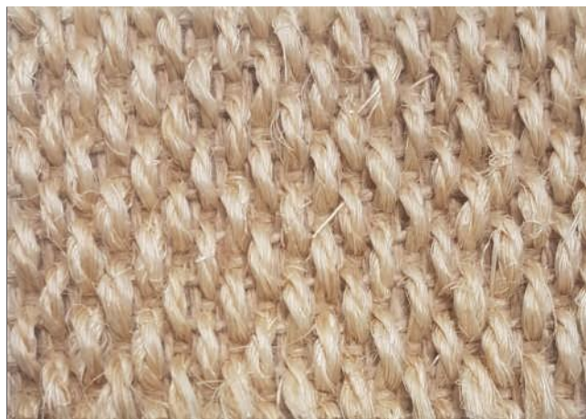
Sisal Natal 14