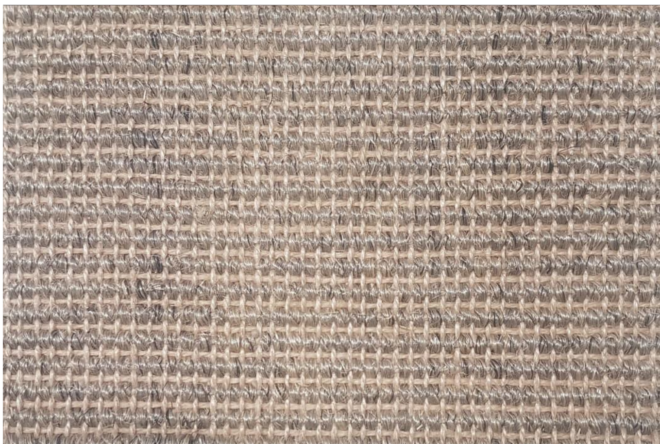
Sisal Fortaleza 22