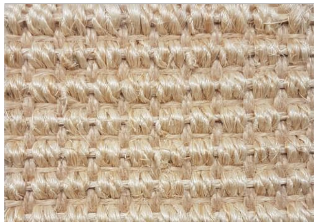
Sisal Recife 14