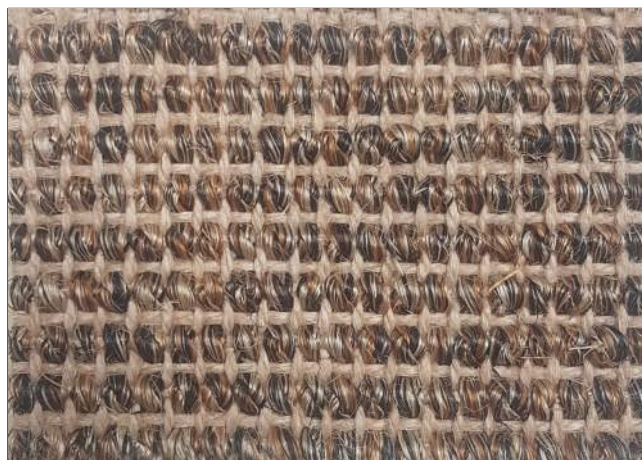
Sisal Fortaleza 18