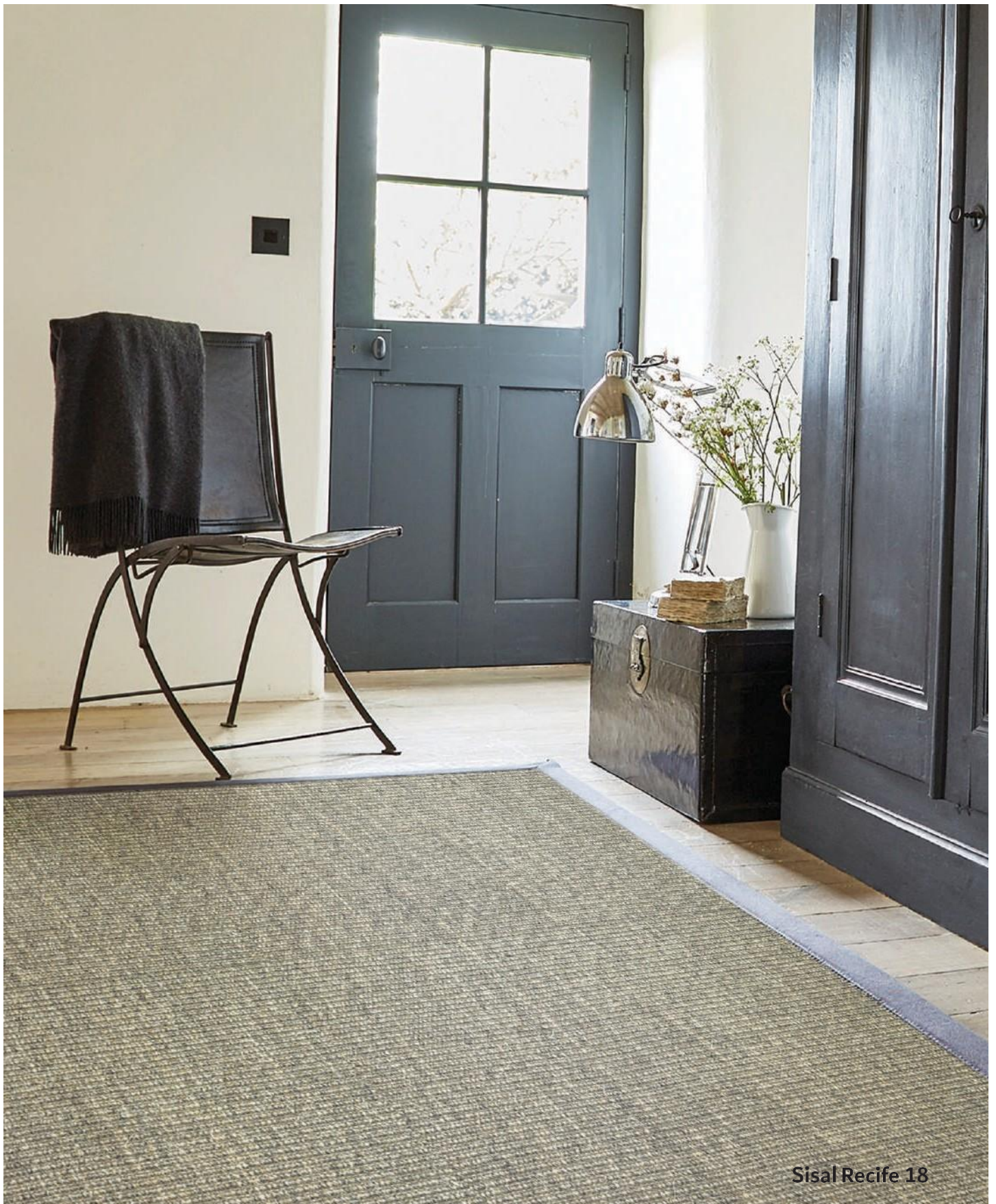
Sisal Recife 18