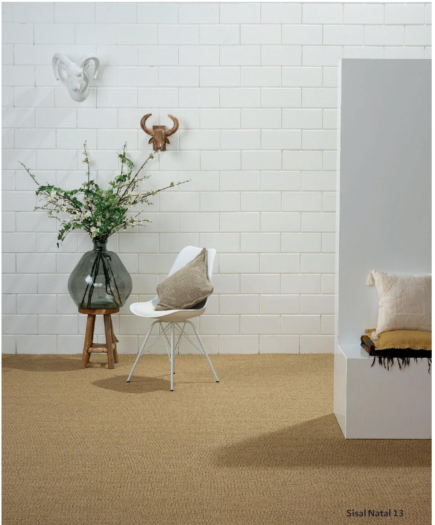
Sisal Natal 13