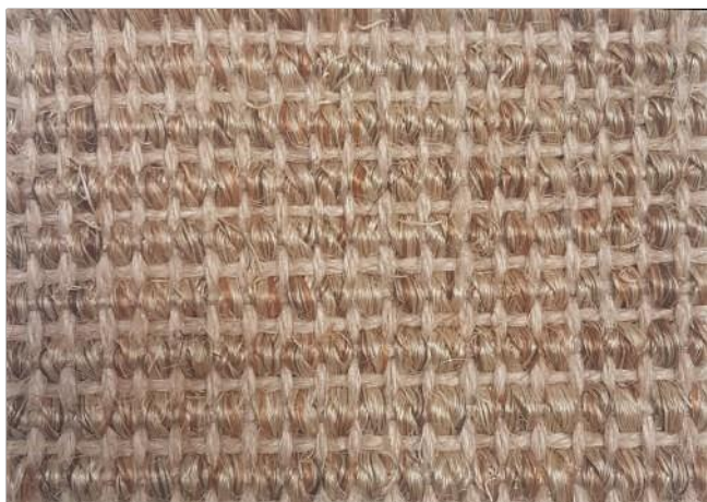
Sisal Fortaleza 15