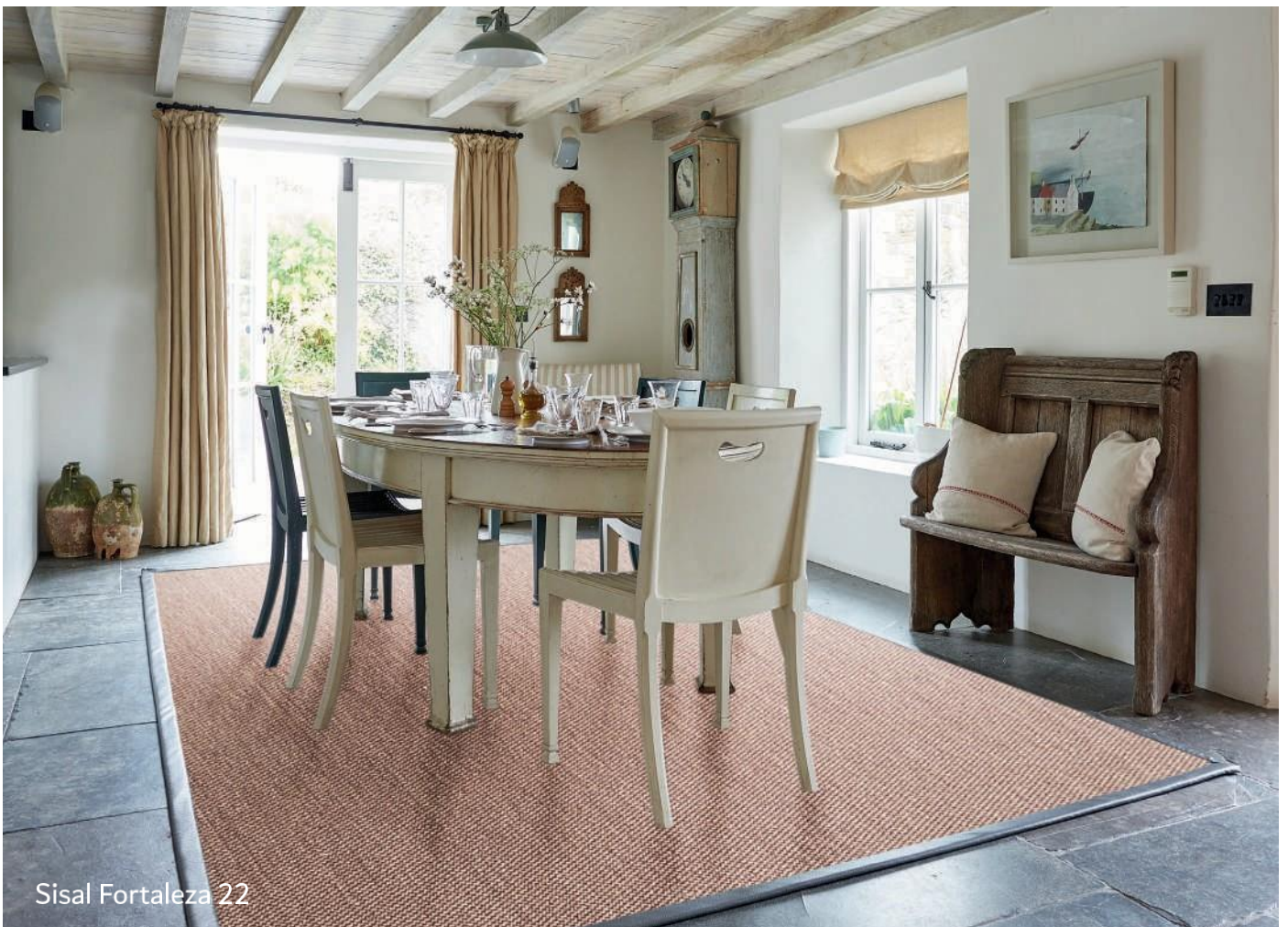
Sisal Fortaleza 22