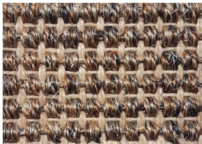
Sisal Recife 18