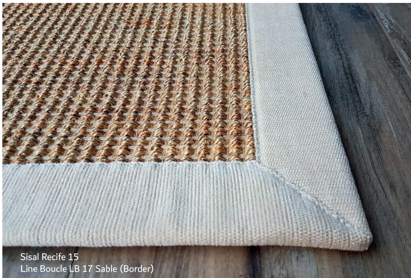
Sisal Recife 15 Line Boucle LB 17 Sable (Border)