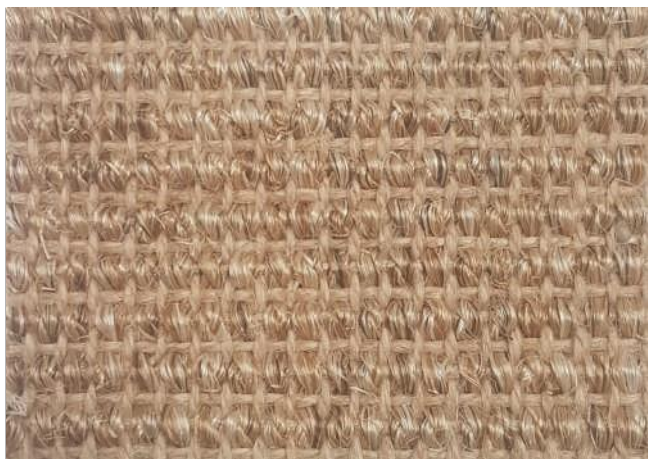
Sisal Fortaleza 13