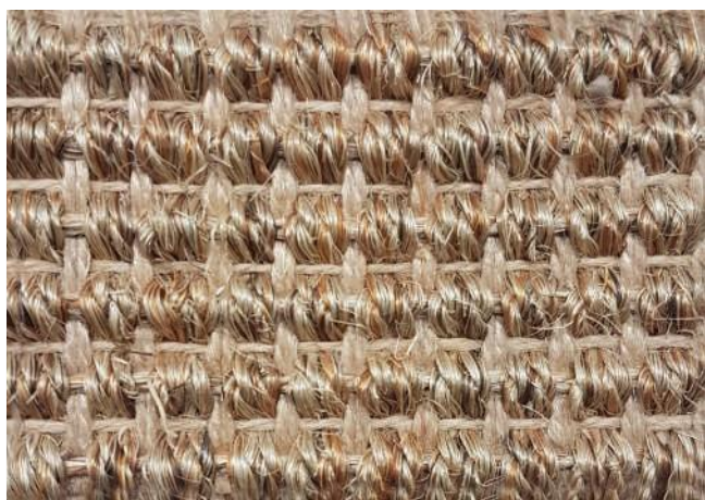
Sisal Recife 15