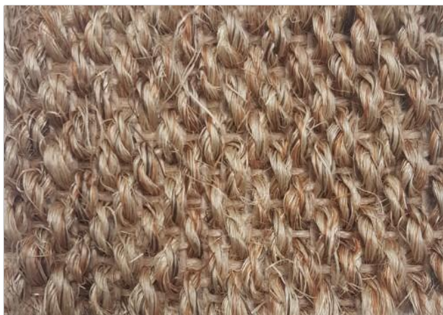
Sisal Natal 15