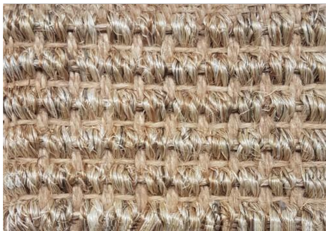
Sisal Recife 13