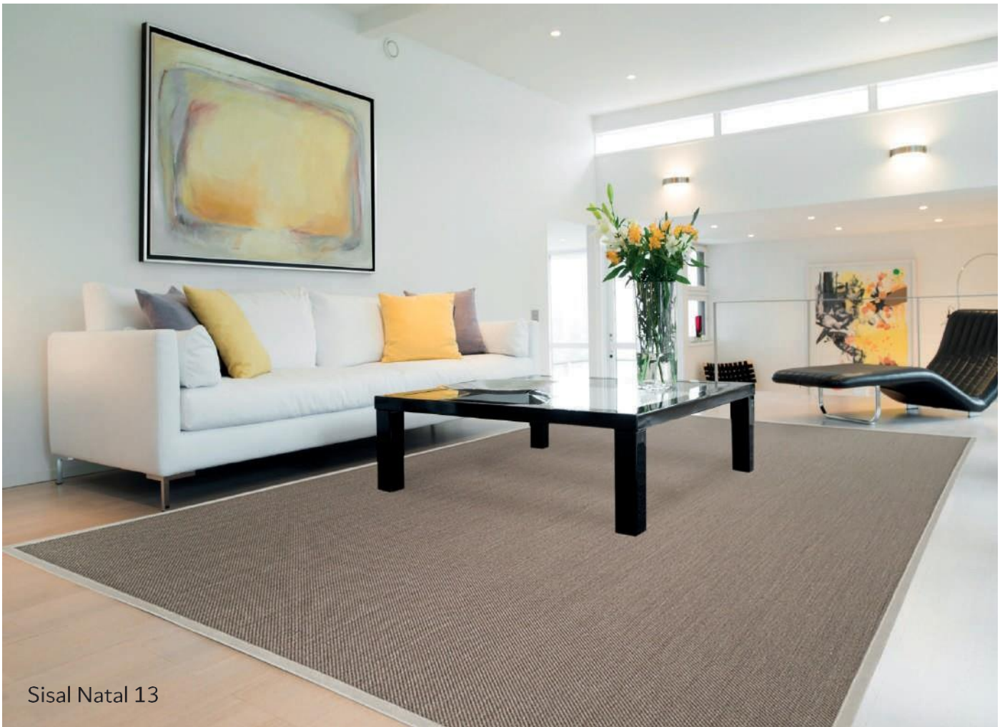
Sisal Natal 13