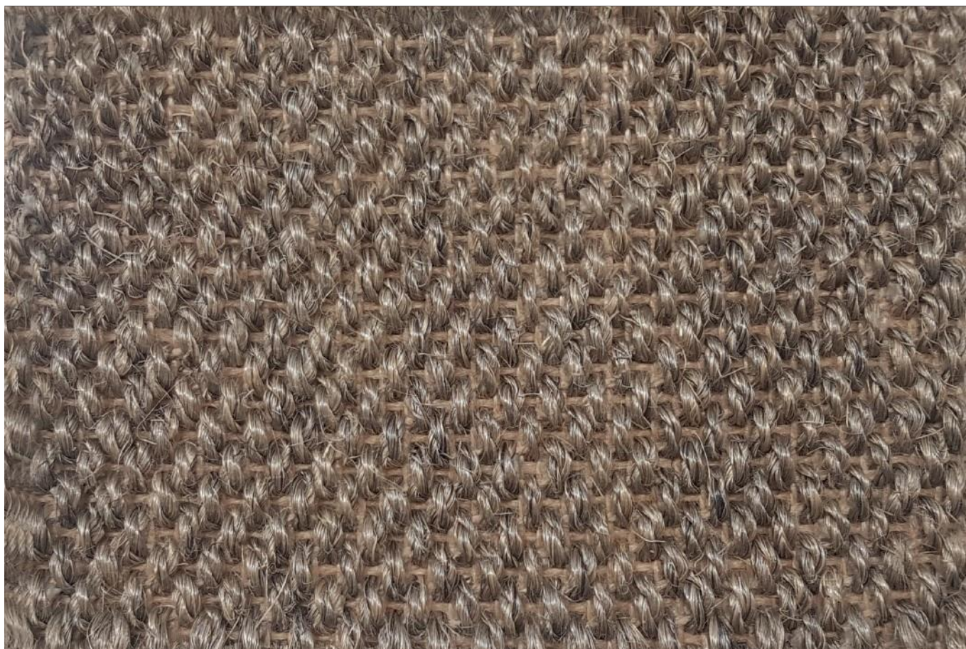
Sisal Natal 22