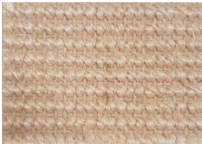
Sisal Fortaleza 14