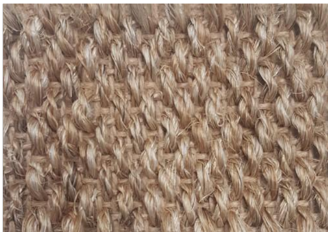
Sisal Natal 13